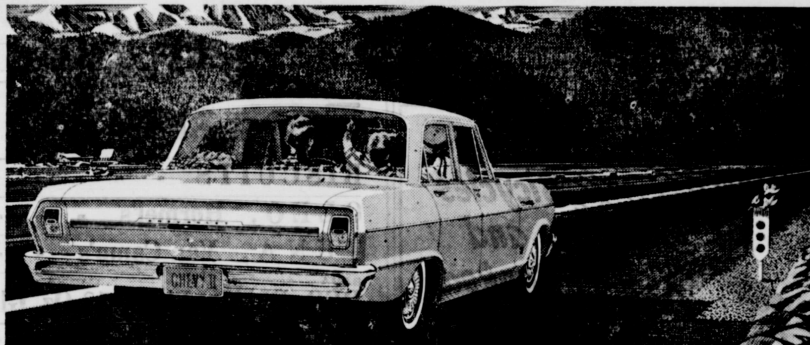
Chevy II Nova 4-Door Sedan