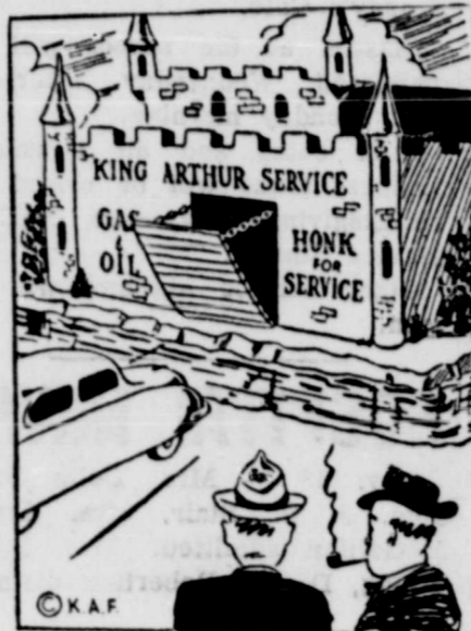
"He always read too many King Arthur stories."

You might read about our type of service in story books — it's that amazing — but we are wide open when you drive in. Give us a trial —soon.