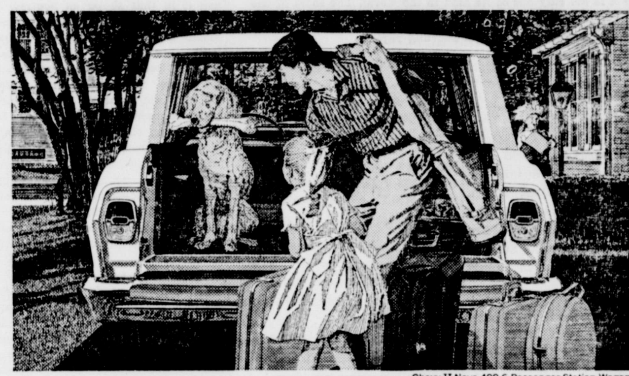
Chevy II Nova 400 6-Passenger Station Wagon