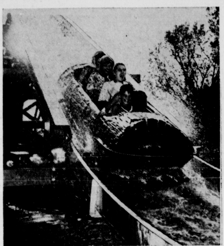
Fantastic new $300,000 Log Flume ride at Six Flags unveiled Tuesday, lives up to all advance expectations. Named the Aserradero it is the only one of its kind in the world. The faces of the passengers aboard this eight foot hollowed out log reflect the thrilling climax down a 44-foot incline at speeds exceeding 10 feet per second into a trough filled with swirling rapids.