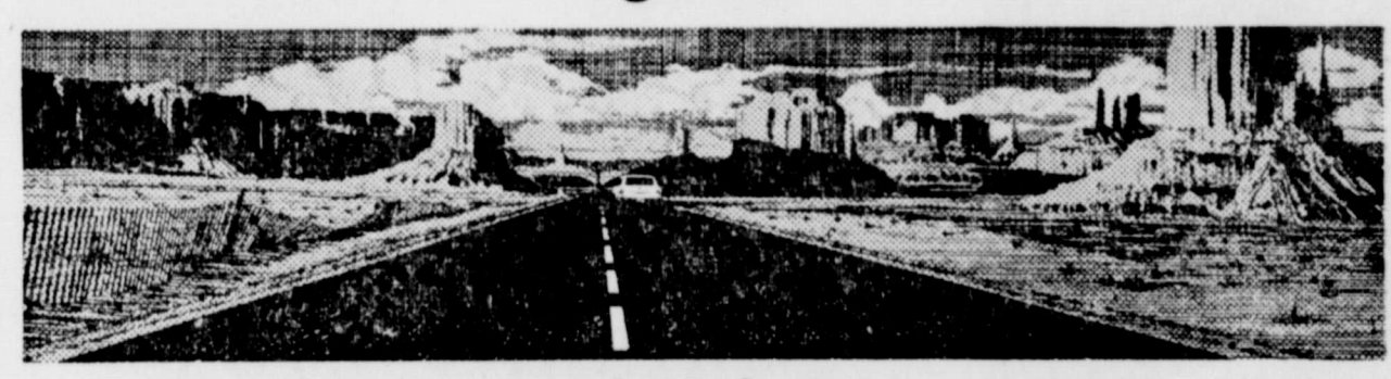
and get lost...