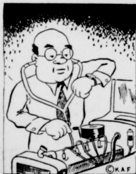
A pure case of carburetor-itus.

The Doctor recommends OUR quality gasoline and oil — and he also recommends "regular" check-ups on battery, tires, and water. For what the doctor ordered, drive in and see us.