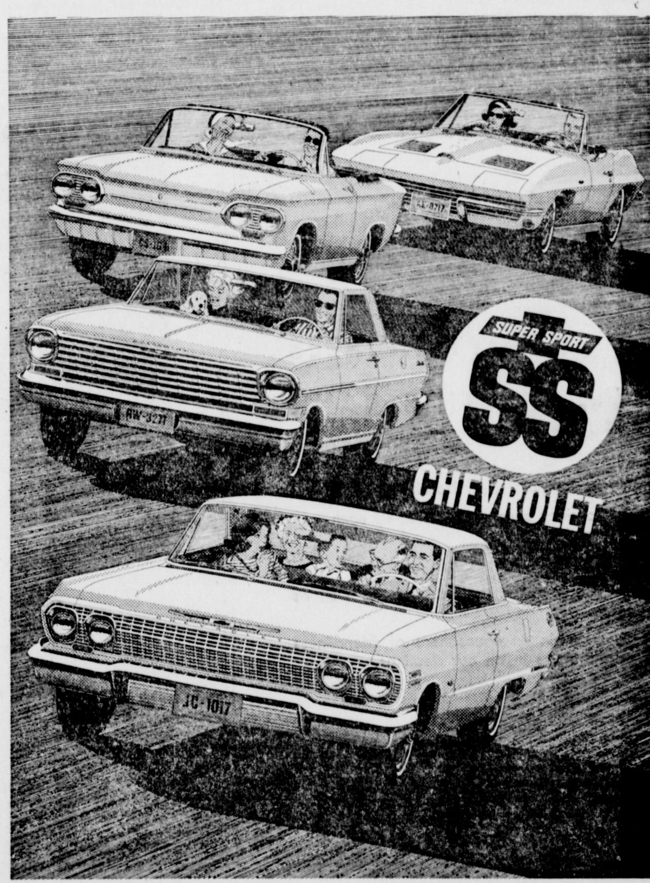
Pictured from top to bottom: Corvette Sting Ray Convertible, Corvair Monza Spyder Convertible, Chevy II Nova 400 SS Coupe, Chevrolet Impala SS Coupe. (Super Sport and Spyder equipment optional at extra cost.)

seats. It even offers a new Comfortilt steering wheel* that positions right where you want it. The new Chevy II Nova SS has its own brand of excitement. Likewise the turbo-supercharged rear-engine Corvair Monza Spyder and the all-new Corvette Sting Rays. Just decide how sporty you want to get, then pick your equipment and power-up to 425 hp in the Chevrolet SS. including the popular Turbo-Fire 409* with 340 hp for smooth, responsive handling in city traffic. *optional at extra cost