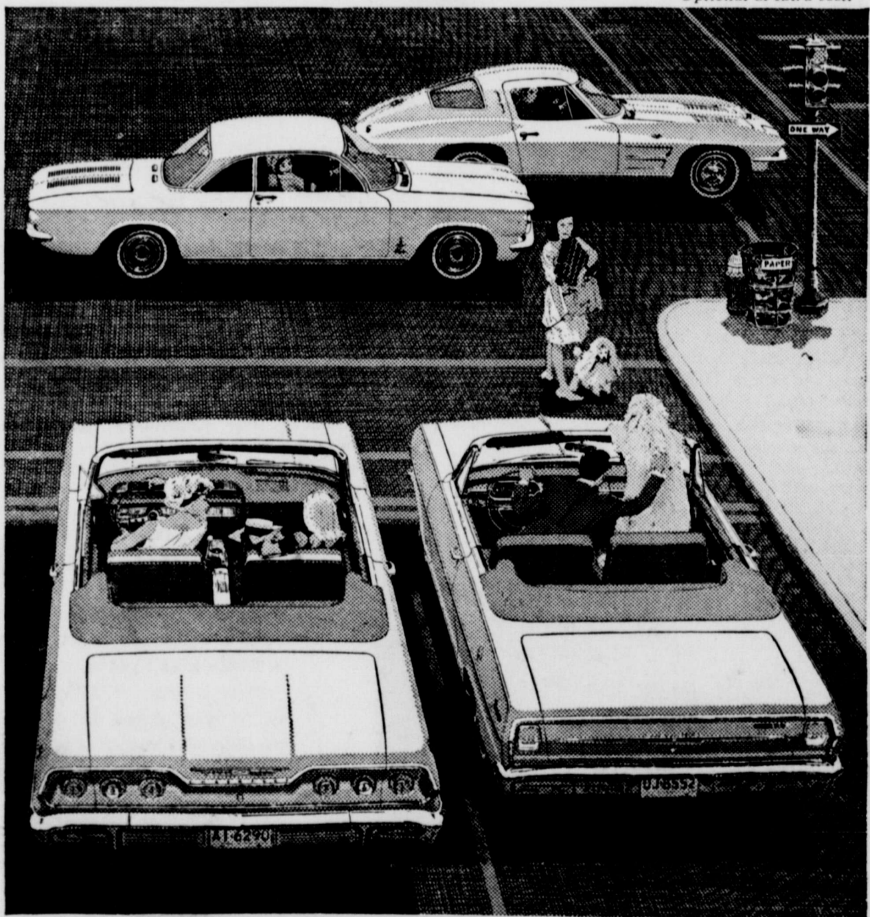
Top—Corvette Sting Ray Sport Coupe and Corvair Monza Spyder Club Coupe. Below—left, Chevrolet Impala SS Convertible; right, Chevy II Nova 400 SS Convertible. (All four available in both convertible and coupe models. Super Sport and Spyder equipment optional at extra cost.)

See four entirely different kinds of cars at your Chevrolet dealer's Showroom