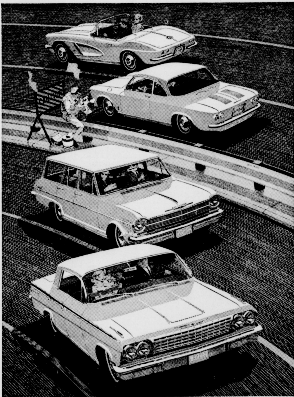
Four Sun 'n' Fun ways to get away (shown top to bottom) are the Corvette, Corvair Monza Coupe, Chevy II Nova Station Wagon and Chevrolet Impala Sport Sedan.

Now, beautiful buying days at your local authorized Chevrolet dealer's Golden Sales Jubilee!