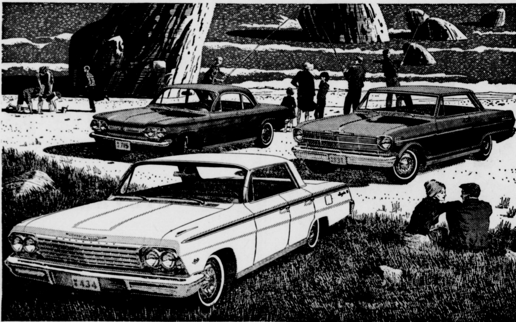
CHEVROLET IMPALA Room, refinement and riding comfort. Foreground, the Impala Sport Sedan.