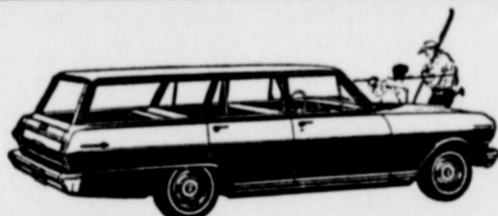
CHEVY II 300 4-DOOR 3-SEAT STATION WAGON. Packs a whopping 76.2 cu. ft. of cargo.

Plate rear springs, the ride reminds you of the big Chevrolet—and you know how smooth that is. The space and cushy comfort inside put you in mind of big cars, too. But Chevy II parts company from anything else around when it comes to offering all these fine features — at a sensible low price. Check your Chevrolet dealer and see for yourself.