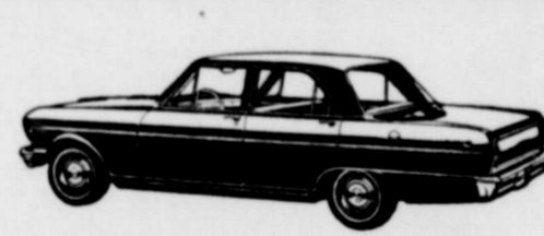
CHEVY II 300 4-DOOR SEDAN. Chevy II's saving ways in a practical 6-passenger family model.

Now . . . look 'em over and try one out!