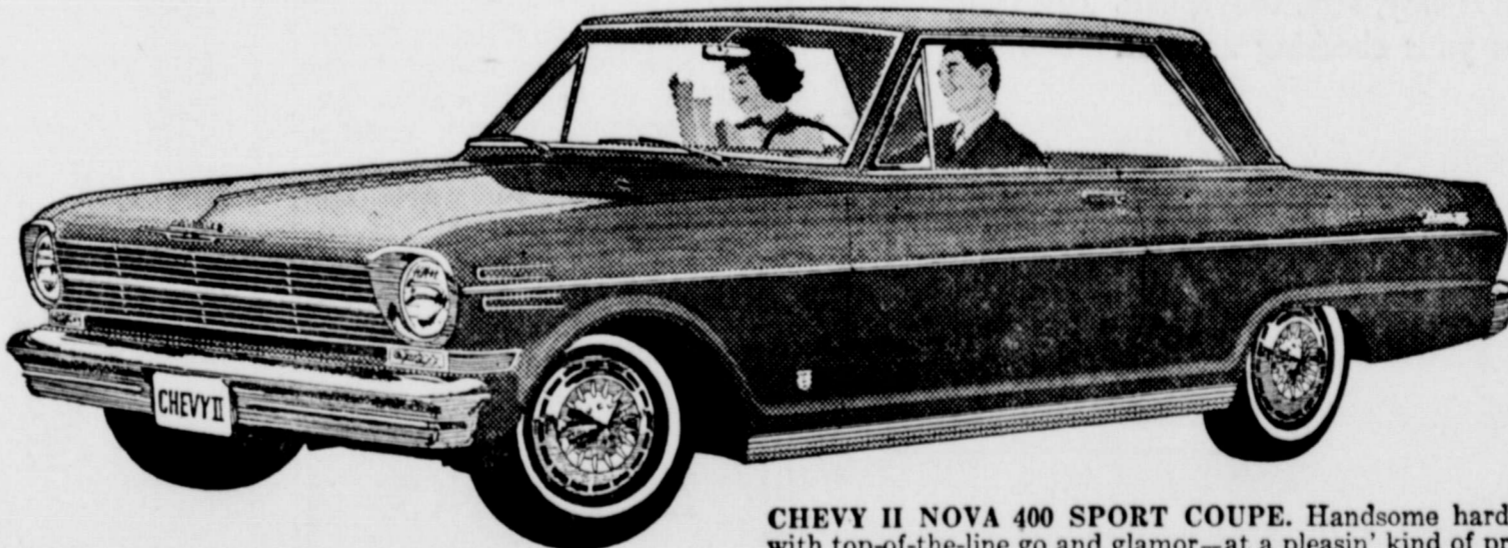
CHEVY II NOVA 400 SPORT COUPE. Handsome hardtop with top-of-the-line go and glamor—at a pleasin' kind of price.

Now . . . look 'em over and try one out!