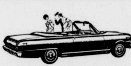
CHEVY II NOVA 400 CONVERTIBLE. It's Chevrolet's newest and lowest priced convertible.