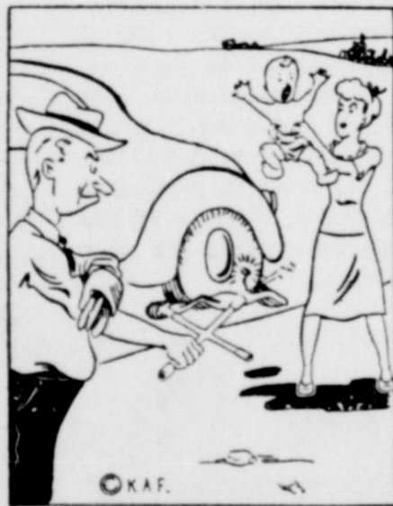
"Must be time for a change."

FOR RENT Furnished 3 Bedroom Home APARTMENTS Furnished or Unfurnished ALSO HOUSES FOR SALE TERMS Dickey & Dickey