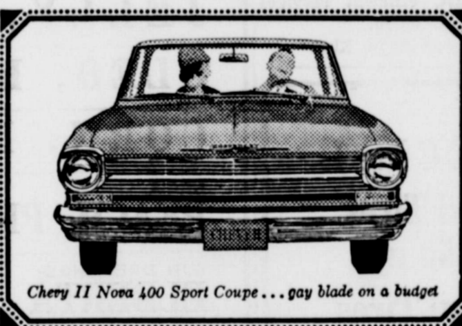
Chevy II Nova 400 Sport Coupe... gay blade on a budget