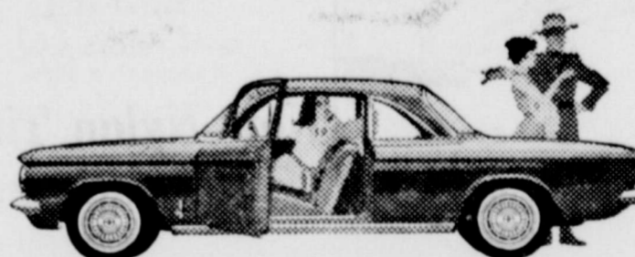
Monza Club Coupe... sporty goer with savings galore

Here's a fleet-footed blend of sports car spirit and thrifty practicality. Along with some neat new refinements, Corvair's rally-proved four-wheel independent suspension, rear-engine design and tenacious traction are all back, as rarin' to go as ever. If you haven't had a go in Corvair, your Chevrolet dealer's the man to correct that oversight.