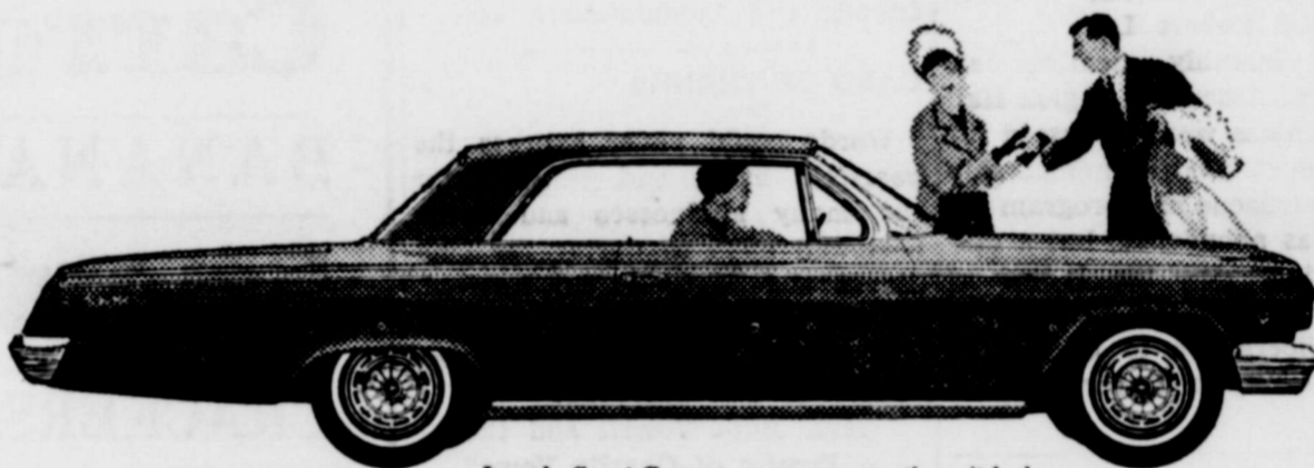
Impala Sport Coupe... goes as smooth as it looks

Come in and drive any (or all three) of these new cars for '62