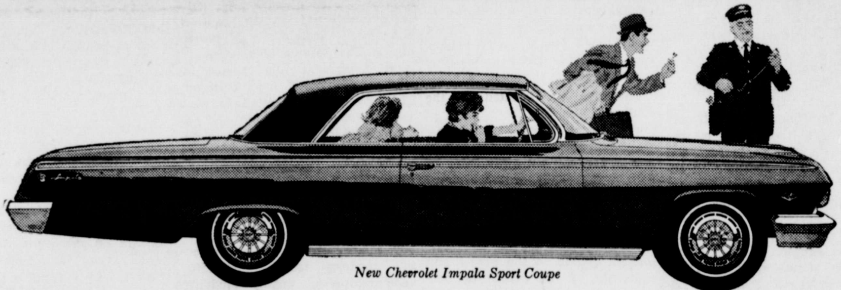
New Chevrolet Impala Sport Coupe

Lovers of good cars - what more could you want!