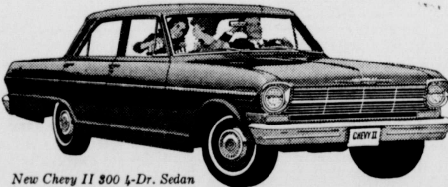
New Chevy II 300 4-Dr. Sedan