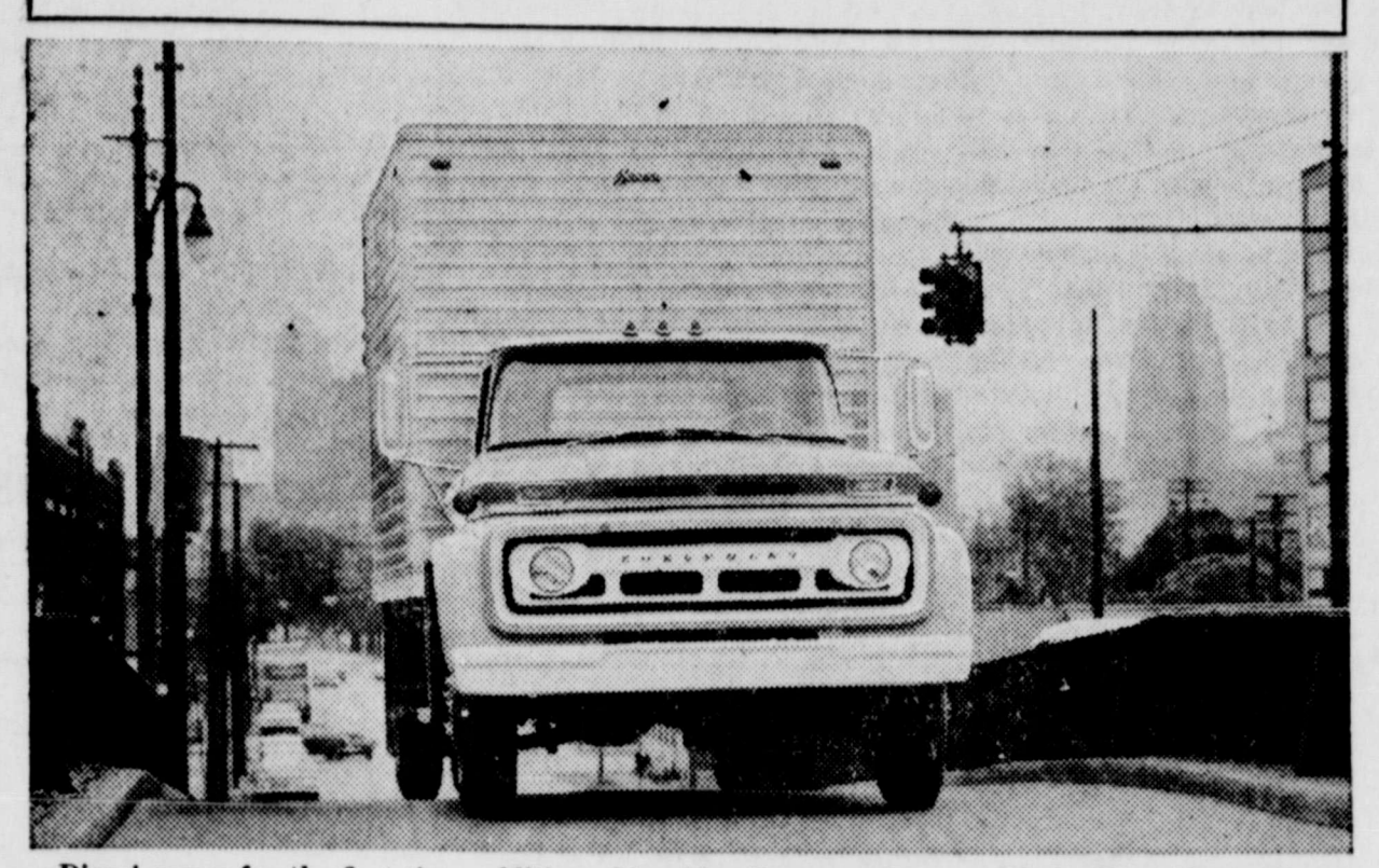
Diesel power for the first time, addition of two | headlamps and longer life mufflers. New optional

higher powered V8's, and lower hood lines for equipment includes alternating current generabetter road visibility highlight Chevrolet's 1962 tors, tinted glass and sliding rear cab window truck line. New to most of the 198 models are for better ventilation. Proved independent front directional signals as standard equipment, single suspension is retained with improvements