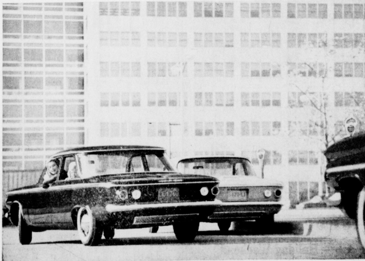
Corvair 700 4-Door Sedan

See your local authorized Chevrolet dealer for economical transportation