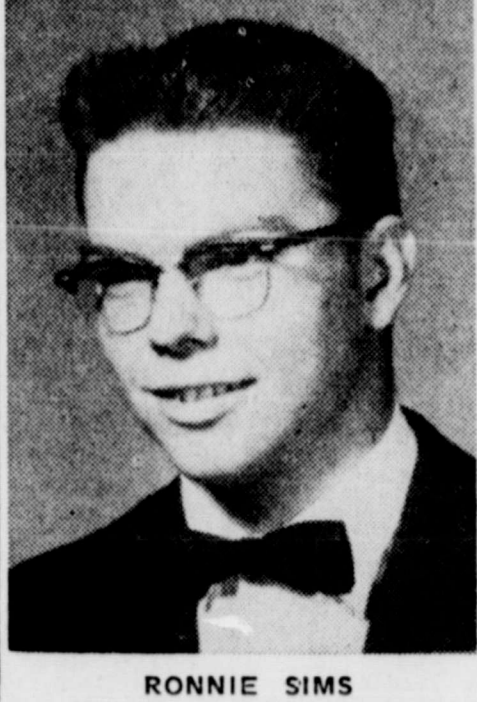
...plays sweet cornet