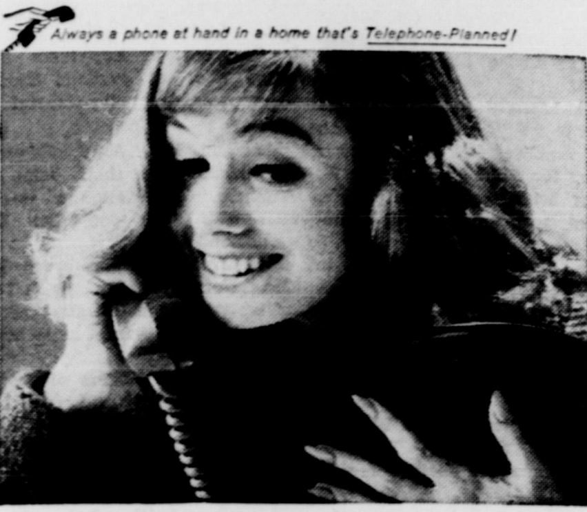
"Come on over-