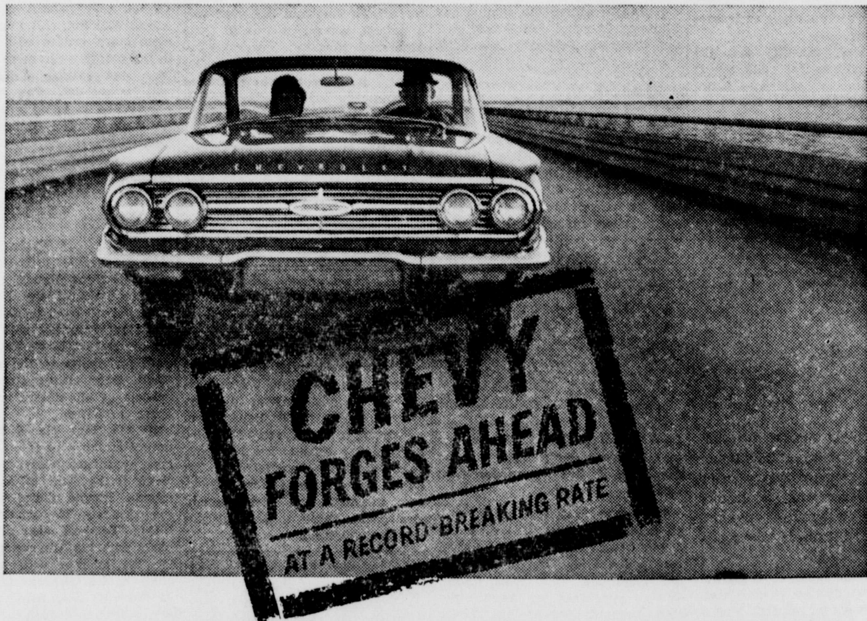
Impala Sport Coupe— one of Chevy's 18 fresh-minted models for '60. See The Dinah Shore Chevy Show in color Sundays, NBC-TV... the Pat Boone Chevy Showroom weekly, ABC-TV.

Factories are turning out more new Chevrolets every day. More proud new Chevy owners taking to the road. Now's the time to see your dealer for fast delivery and a favorable deal!