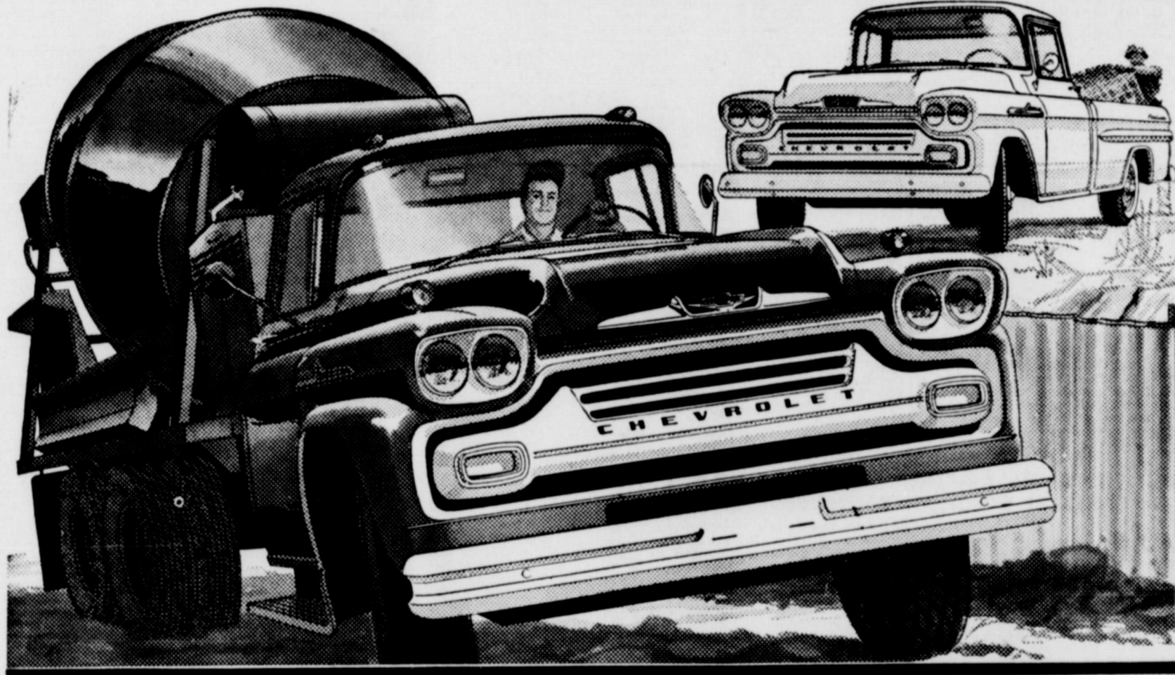
Heavy-duty 100 Series tandem (foreground) and Fleetside pickup.

You get the right power... right down the line!