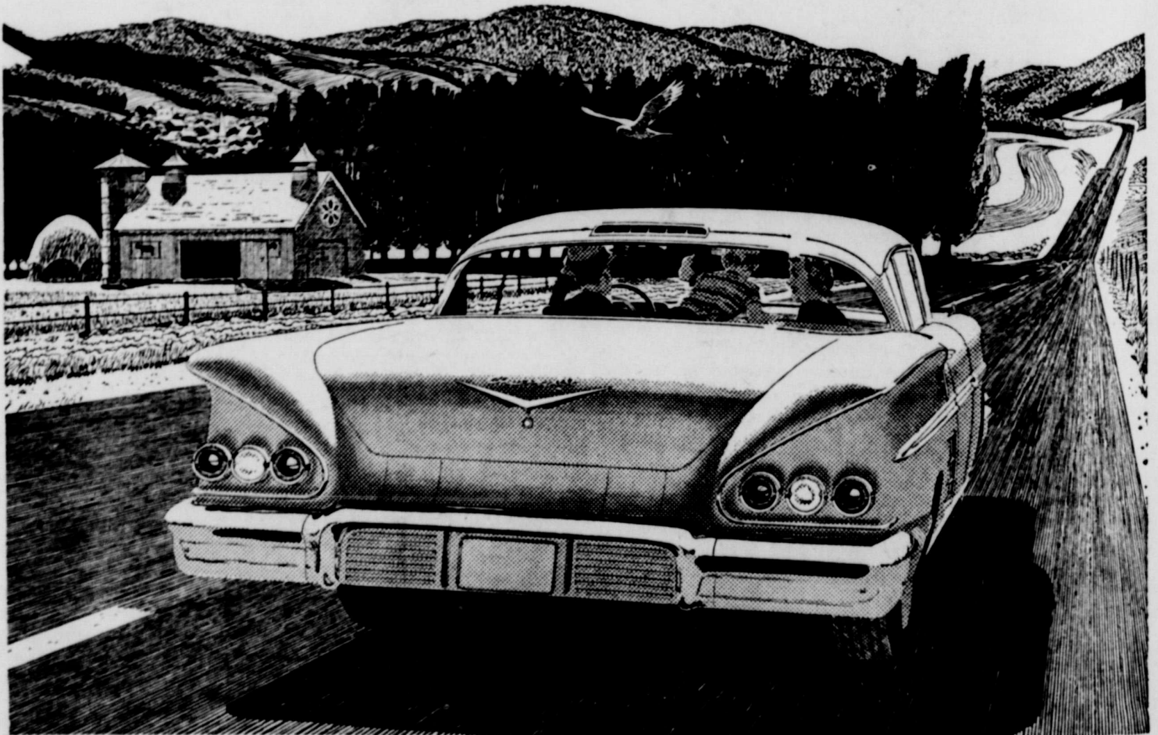
See the Chevy Show, Sunday night on NBC-TV and the weekly Chevy Showroom on ABC-TV.