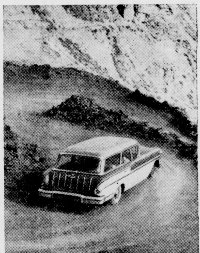
Grade Retarder gave extra braking on corkscrew descents

Atlantic to Pacific and back, across the towering Andes, in 41 hours.