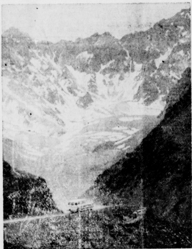
Precision roadability was vital on this wild trail!

Air Conditioning-remperatures made to order-for all-weather comfort. Get a demonstration!