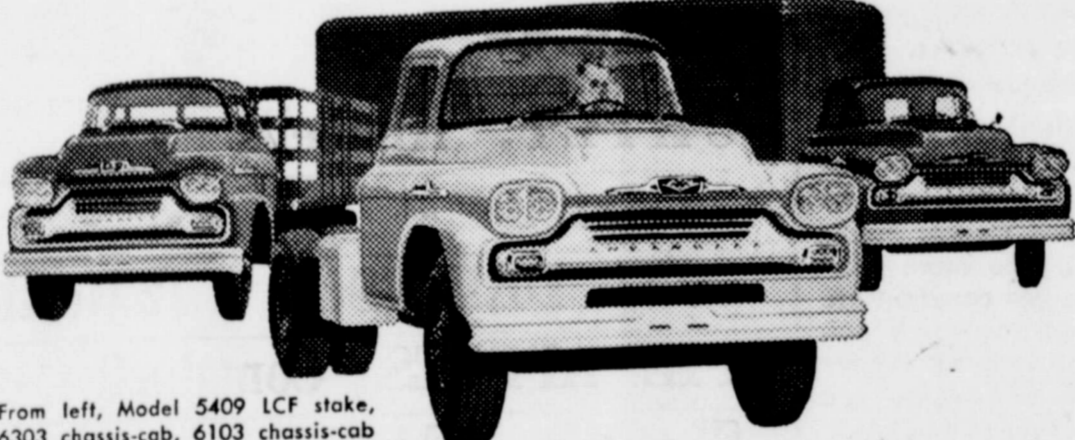
From left, Model 5409 LCF stake, 6303 chassis-cab, 6103 chassis-cab