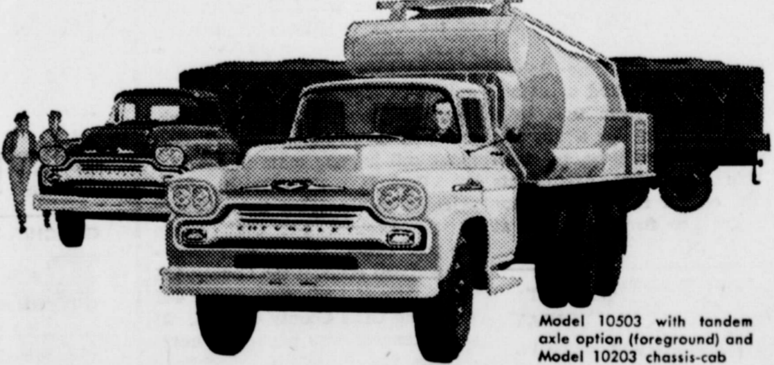
Model 10503 with tandem axle option (foreground) and Model 10203 chassis-cab

The heavy-duty Spartans make hauling history with the most revolutionary truck engine in decades—the Workmaster V8 with Wedge-Head design! Featured on high-tonnage heavyweights, this completely new 230-h.p. power plant achieves a new high in efficiency! Your Chevrolet dealer is eager to show you many other advanced features, including Triple-Torque Tandem options that boost GCW ratings all the way to 50,000 lbs.!