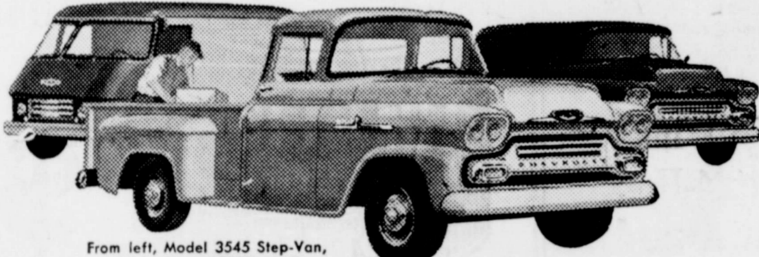
From left, Model 3545 Step-Van, 3204 pickup, 3805 panel