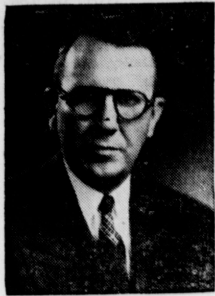
O. C. FISHER U. S. Congressman