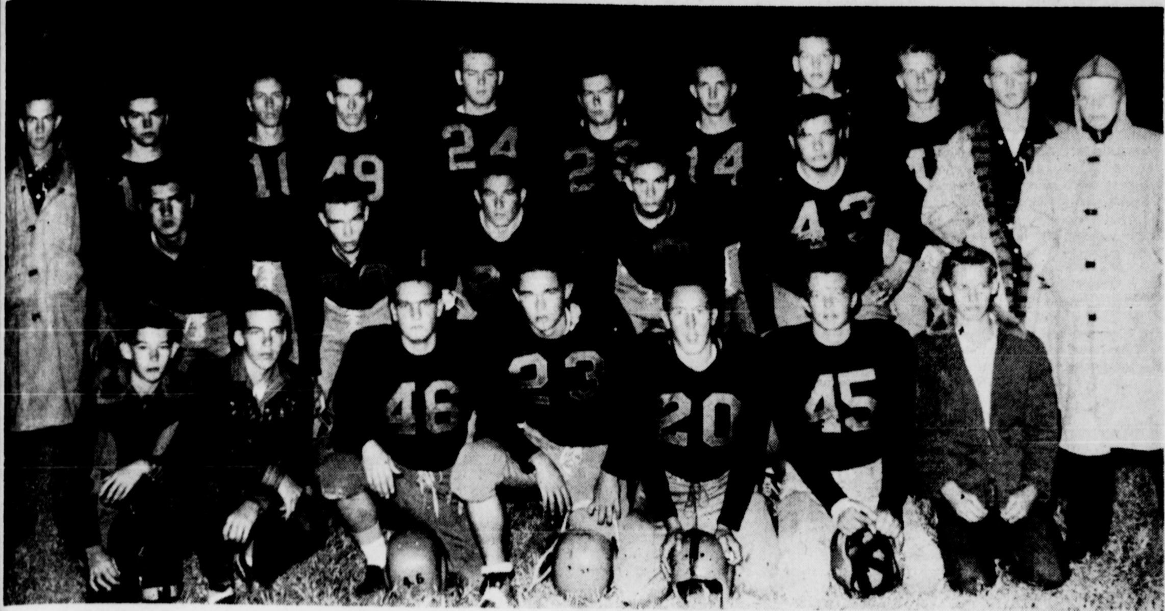
Robert Lee High School Steers—Football Season 1957