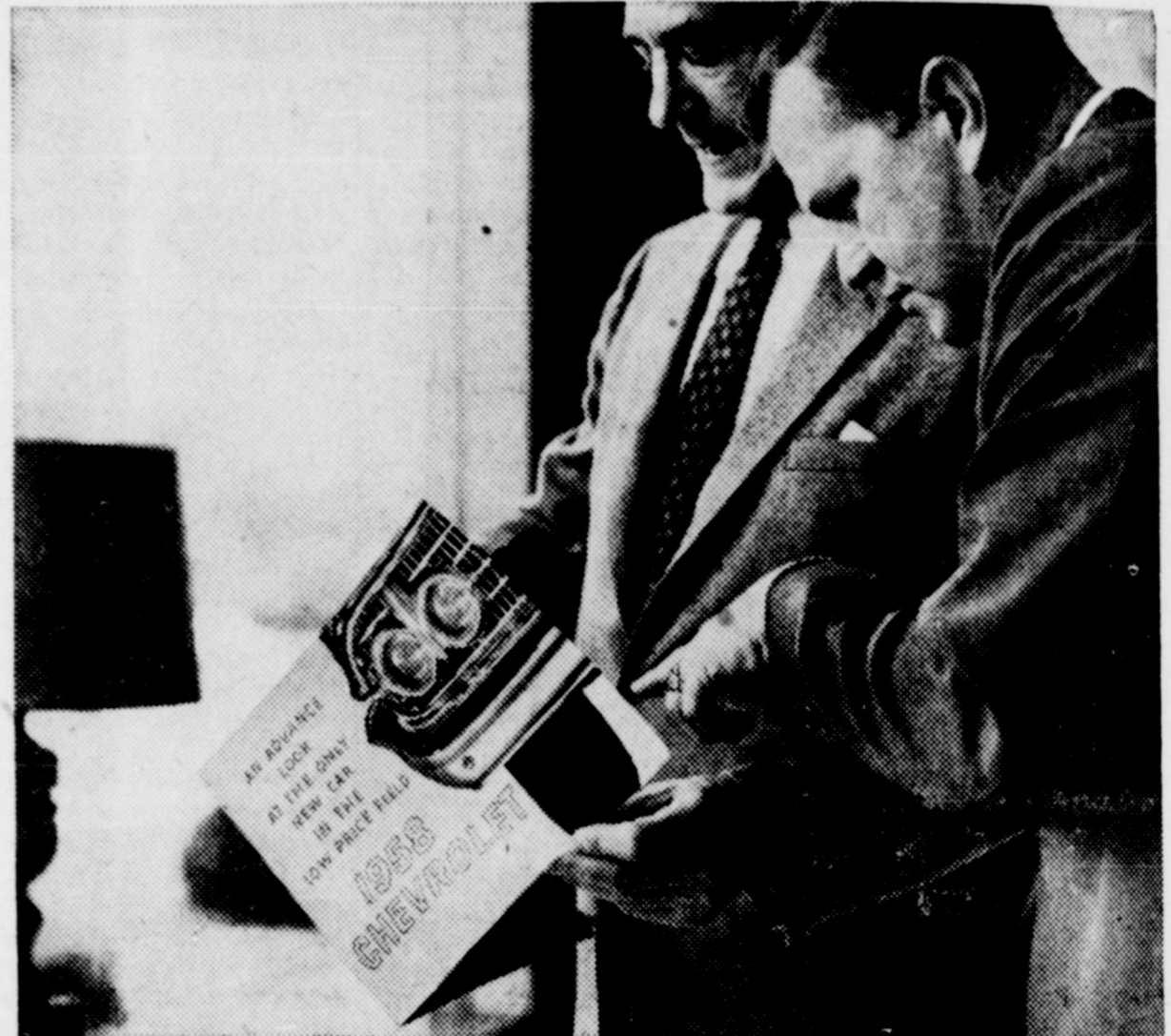
You can place your order now at Your Local Authorized Chevrolet Dealer's