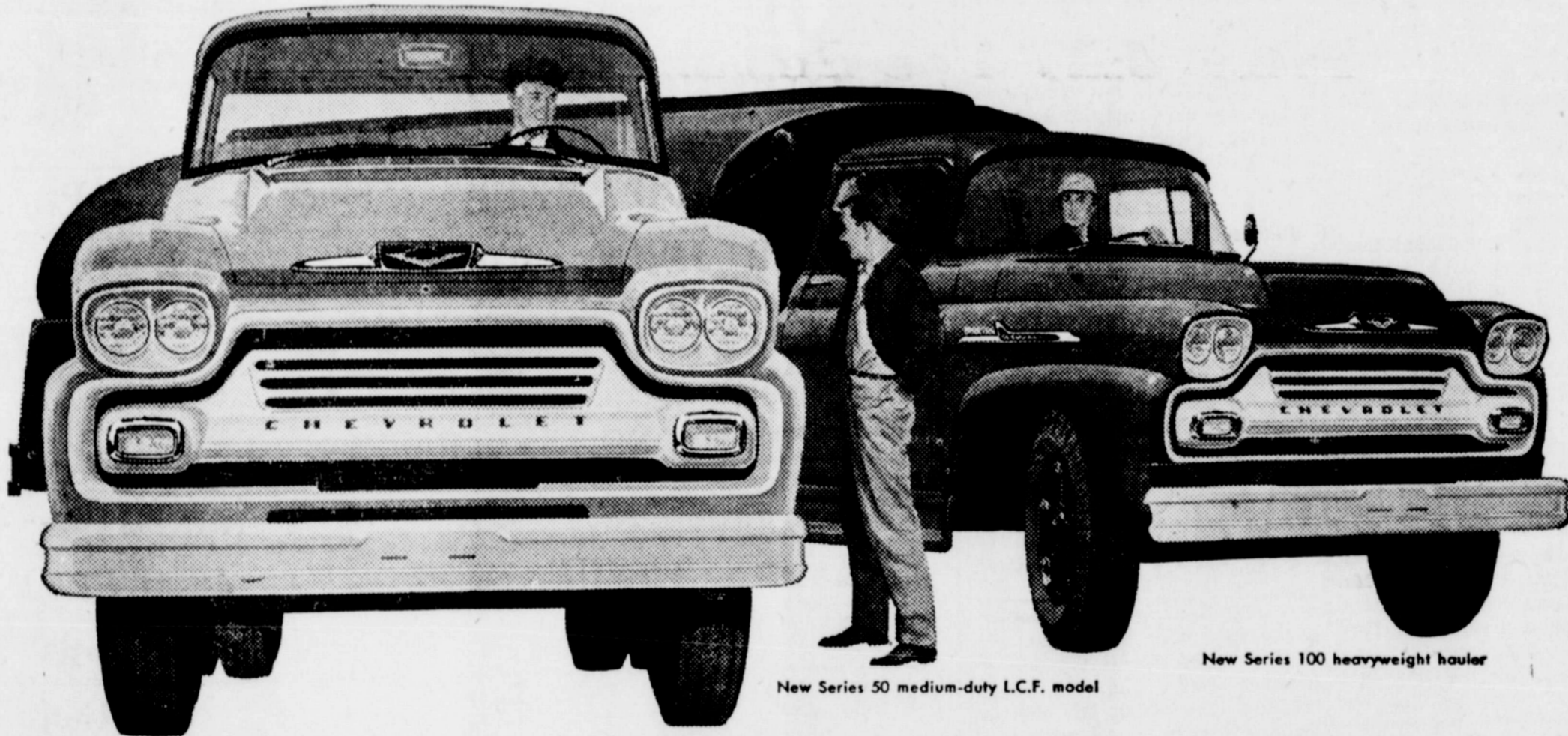
New Series 50 medium-duty L.C.F. model