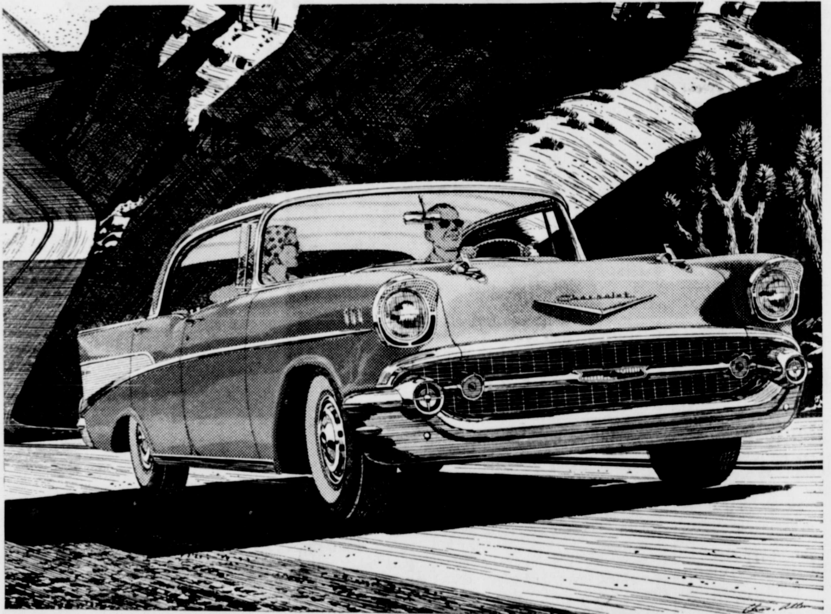
The beautiful Bel Air Sport Sedan with Body by Fisher.

AIR CONDITIONING—TEMPERATURES MADE TO ORDER—AT NEW LOW COST. GET A DEMONSTRATION!