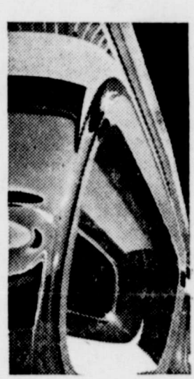
BOLD, IMAGINATIVE LINES.—Here is the first dream car you can own. the first car you can buy with Dream-Car Design. Here's distinctive, distinguished styling shared by no other car.