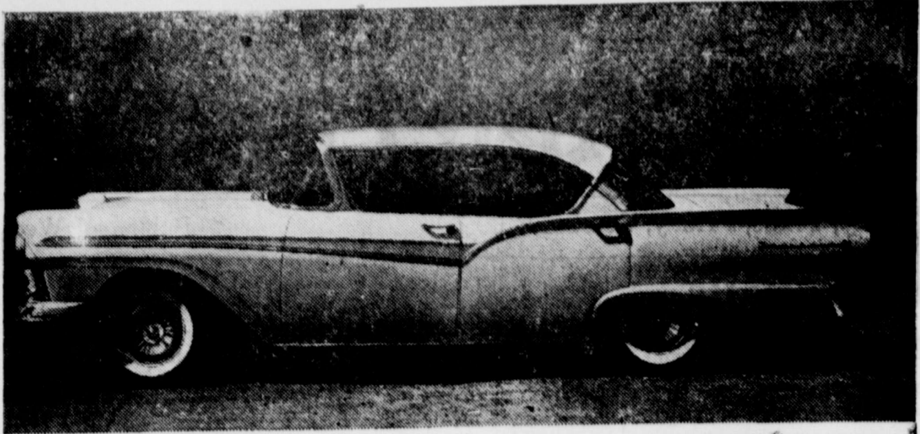
From the road up, 1957 Fords are a complete departure from previous models. They will be unveiled by Ford dealers in 19 body styles, of which this is the four door Victoria, a member of the new "Fairlane 500" series. Fairlane models are nine inches longer and four inches lower than their 1956 counterparts. Though the new models are lower, interior headroom is as great as last year, since the car's chassis and floor are re-designed for a lower center of gravity.