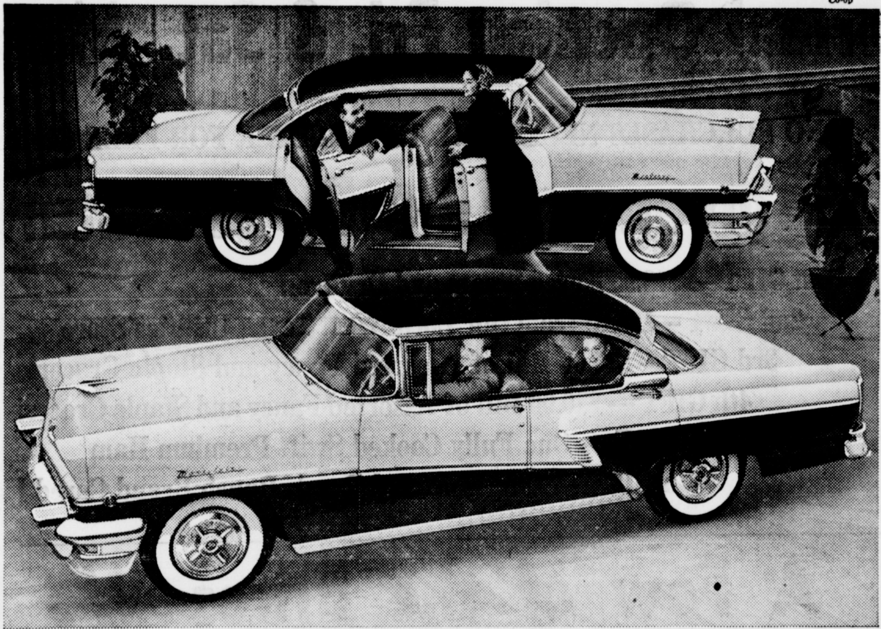
THE NEW MONTCLAIR AND MONTEREY PHAETONS—No center pillars, of course. But more important, no view-cramping curve of the roof—only the whole wide world to see.

Newest, most advanced design in 4-door hardtops. Available in Montclair, Monterey, or Custom series.