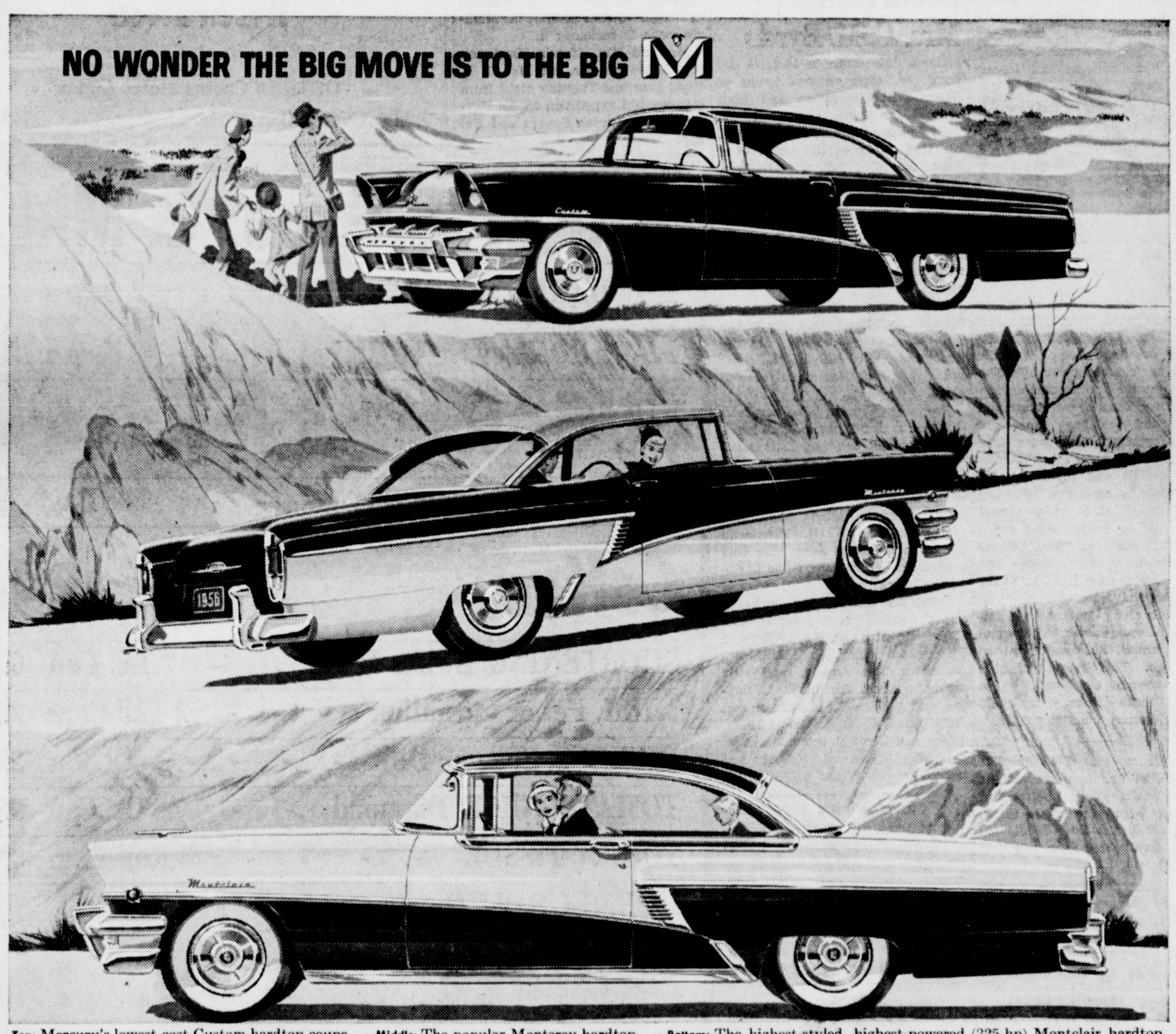
Top: Mercury's lowest-cost Custom hardtop coupe.