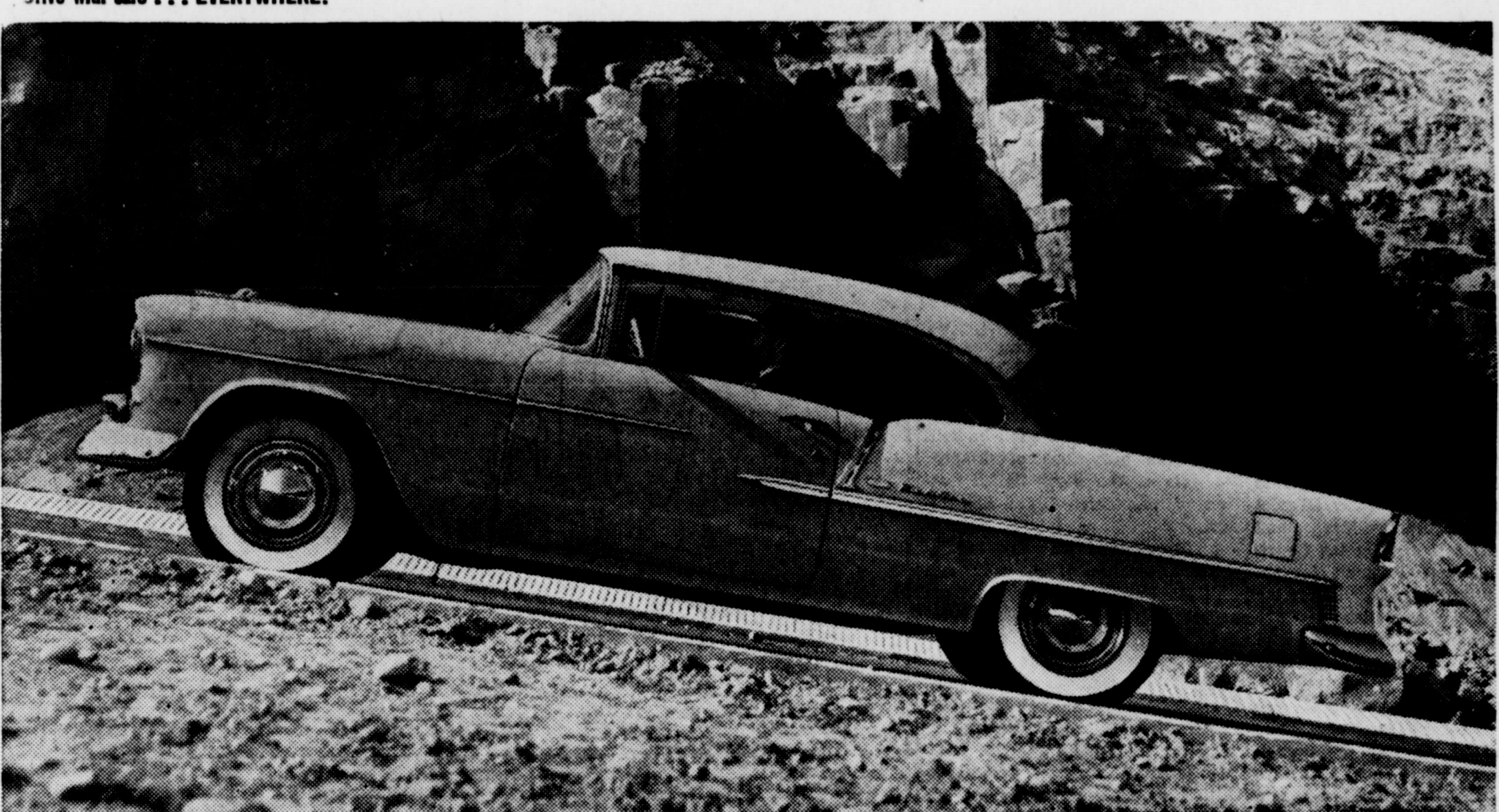
Great Features back up Chevrolet Performance: Anti-Dive Braking-Ball-Race Steering-Outrigger Rear Springs-Body by Fisher-12-Volt Electrical System-Nine Engine-Drive Choices.

A lightning-quick power punch that makes your driving safer! That's one of the reasons for Chevrolet's winning stock car record—but it's not the only one. Not by a long shot!