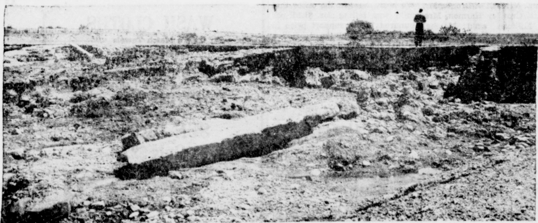
DAMAGED SPILLWAY —The Robert Lee Mountain Creek dam spillway is pictured here in its damaged condition. A flood last summer washed away considerable earth and damaged concrete stringers. Engineers and UCRA officials failed to agree on how to construct a permanent spillway until recently, when a concrete apron

Cost of the spillway repairs will be paid from UCRA funds, but will be assessed to the City of Robert Lee and added on to the original cost of the Mountain Creek municipal water project. The city is repaying the UCRA at the rate of $350 per month.