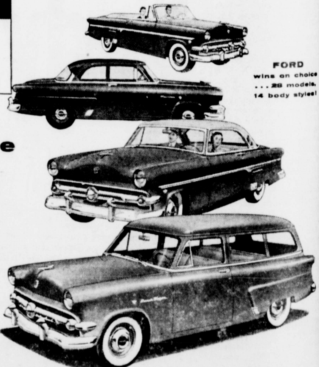
FORD wins on choice... 28 models, 14 body styles!

FORD WINS ON STYLING With... Clean, crisp, trend-setting lines. • A truly modern, long, low, sleek silhouette. • Smooth, graceful fender line. • Low, subtly-curved, modern hoodline. • Fashion-tailored interior fabrics and trim. ... WHICH NO OTHER CAR IN FORD'S FIELD CAN MATCH!