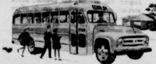
B-500 Series 154-in. wheelbase for up to 36-passenger bodies. With V-8 or Six.