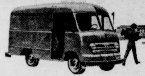
P-350 Series Parcel Delivery Chassis- Windshield front end for 7- to 11 1/2-ft. bodies G.V.W. 7,800 lbs.