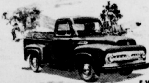
F-100 Series 6 1/2-ft. Pickup. Also 8-ft. Panel. 6 1/2-ft. Stake. 4800 lbs. G.V.W. 110-in. wheelbase.