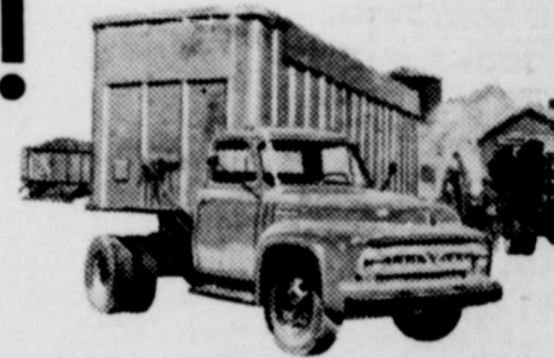
F-600 Series Tractor with Van Trailer 16,000 lbs. G.V.W., 28,000 lbs. G.C.W.