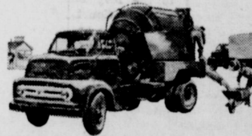
C-800 Series BIG JOB G.V.W. 23,000 lbs., G.C.W. 48,000 lbs.