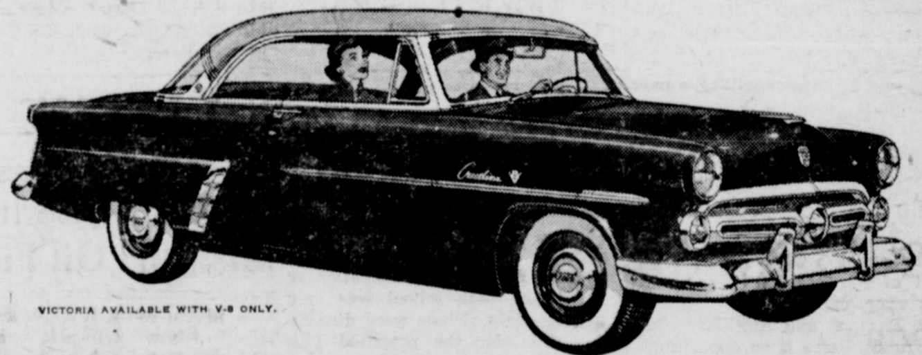
VICTORIA AVAILABLE WITH V-8 ONLY.

Never before has a car given you so much for the money!