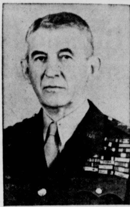
Gen. Walter Krueger