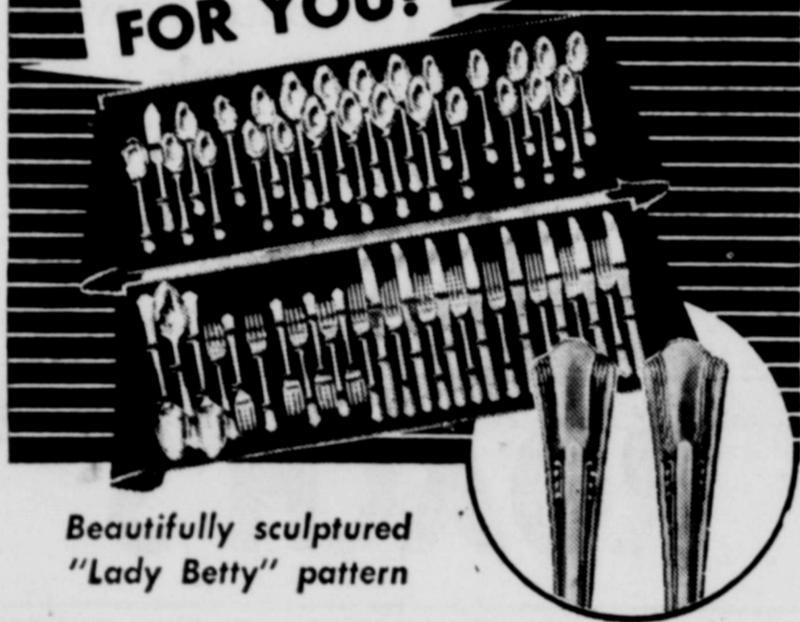
Beautifully sculptured "Lady Betty" pattern