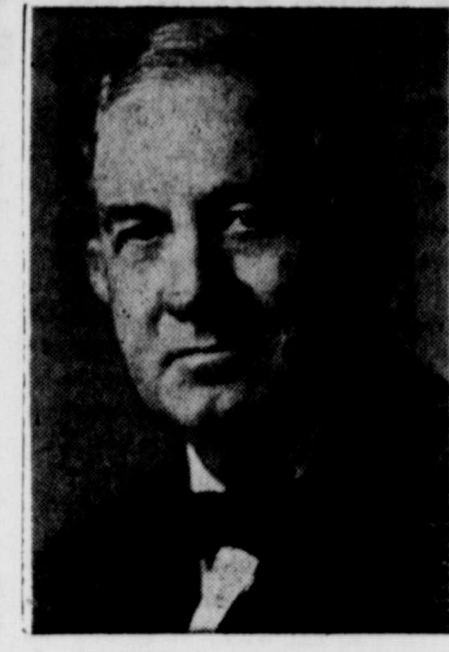
Senator Tom Connally

Our goal for this week is: 1, Select good club officers; 2, Re- ed in New Orleans. solve to attend every club meetand prayer.-Beth Newell,