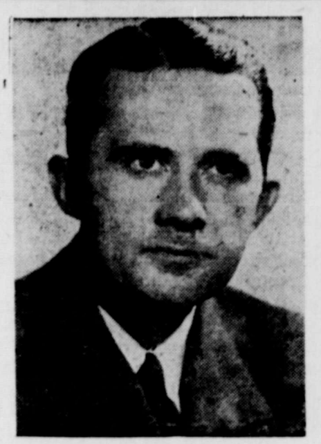
Gov. Allen Shivers

Received a copy of The Tritonian, propriate heading.