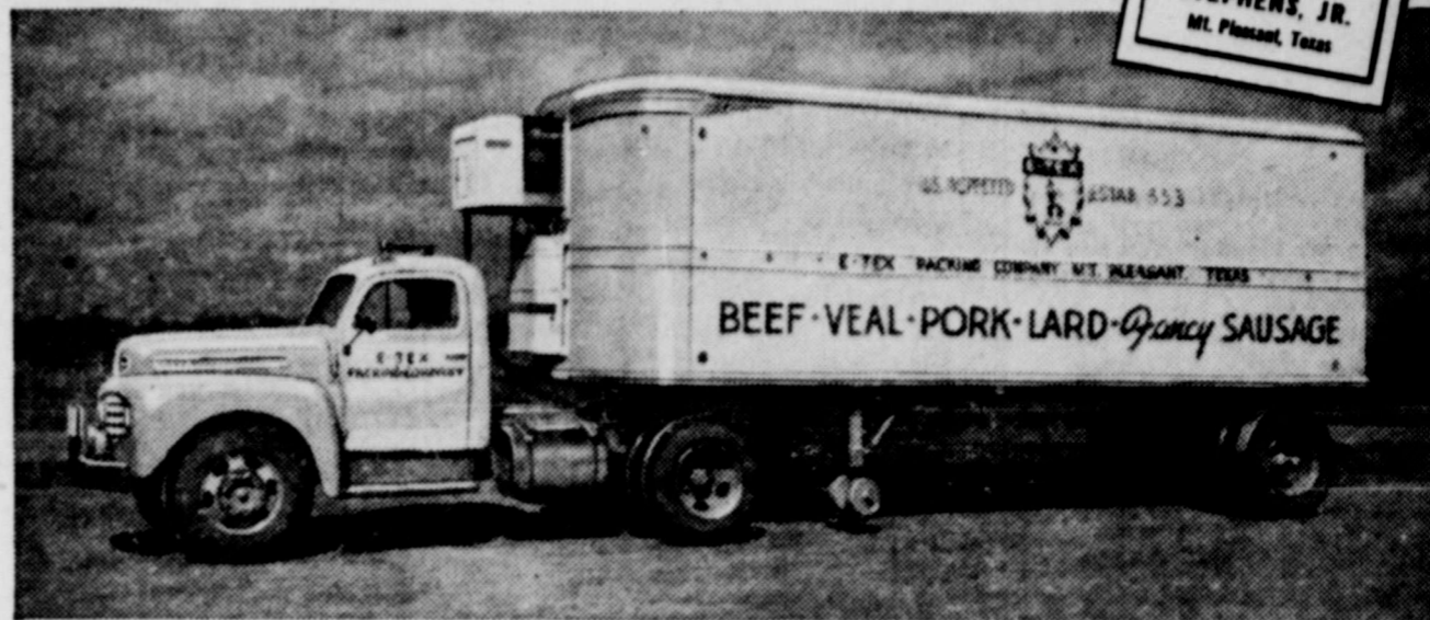
Ford 145-horsepower Model F-7 BIG JOB shown has Gross Combination Weight rating of 35,000 lbs. as a tractor; Gross Vehicle Weight rating of 19,000 lbs.

"Our two Ford BIG JOBS have given better performance than any trucks we ever owned"