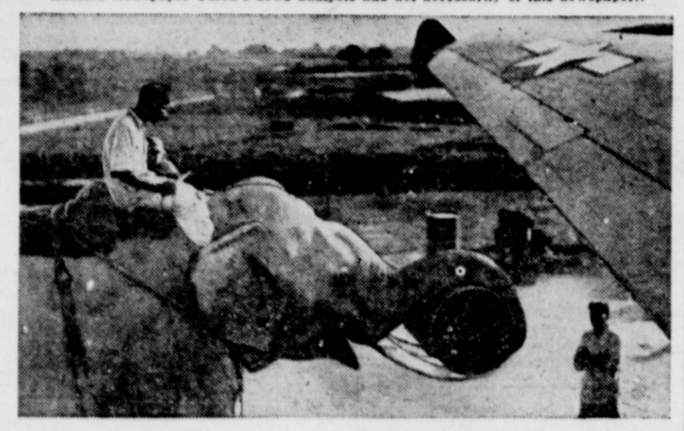
Able to perform the work of 12 coolies, this elephant loads gas drums on American transport command plane flying supplies to troops in Burma.