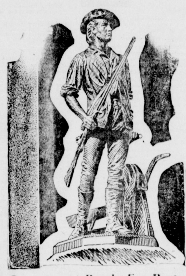
Buy Government Bonds For Protection All Out For Defense