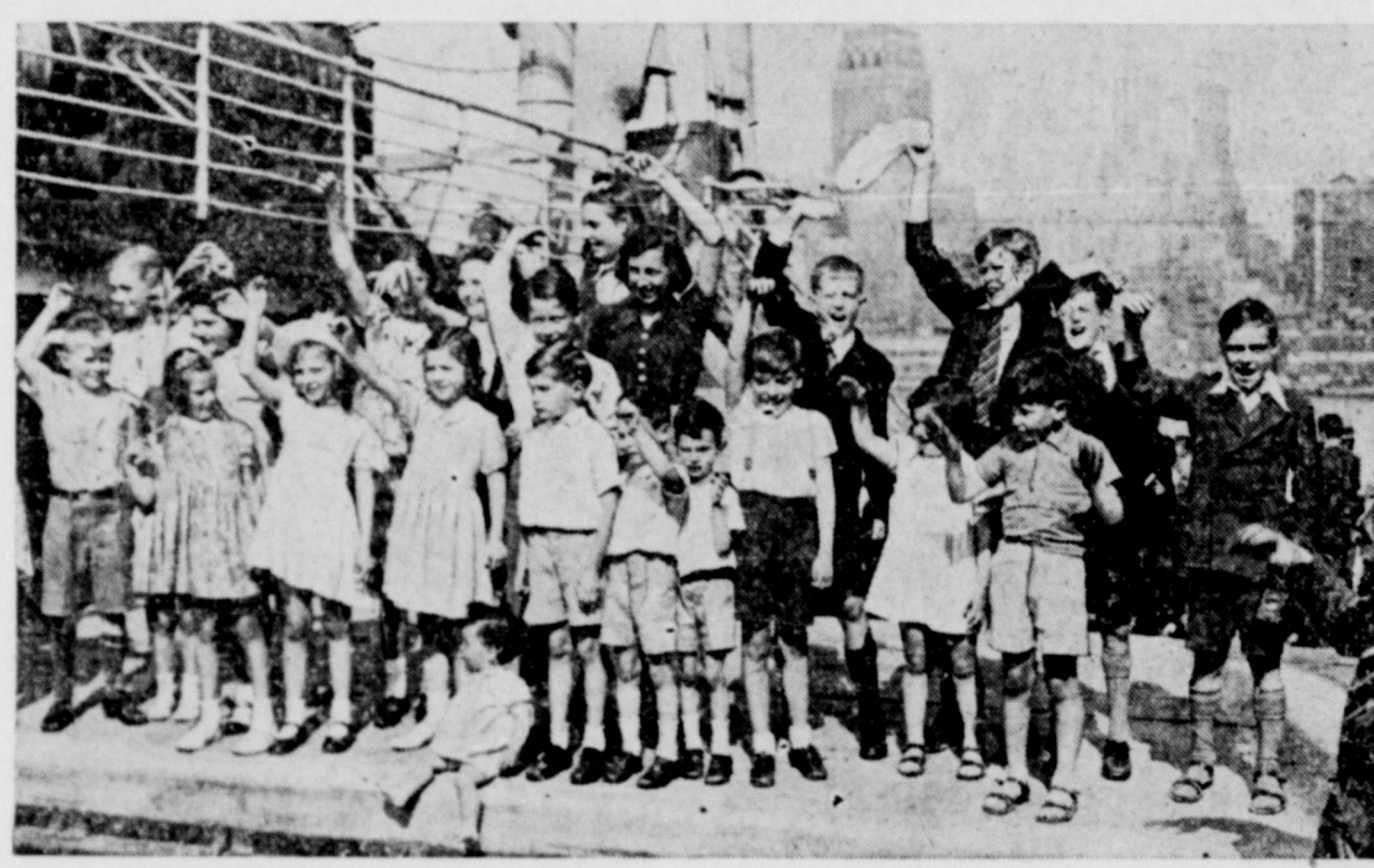
A group of refugee British children are shown after their arrival in New York city. These youngsters are more fortunate than thousands more in England who, because of a shortage of shipping facilities cannot be brought over immediately. The refugee children will be cared for by friends and relatives in America. The United States Committee for the Care of European Children is in charge of arrangements for placing the youngsters in American homes.