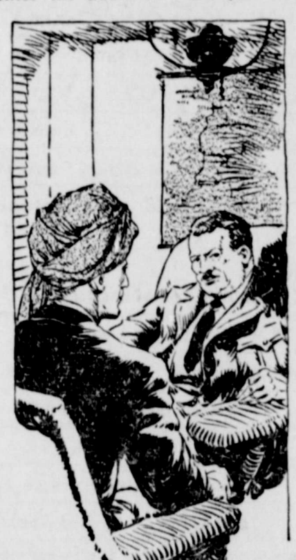
The Resident decided to take hatred by the horns.

"Yes. While he was waiting to enter the audience room just now