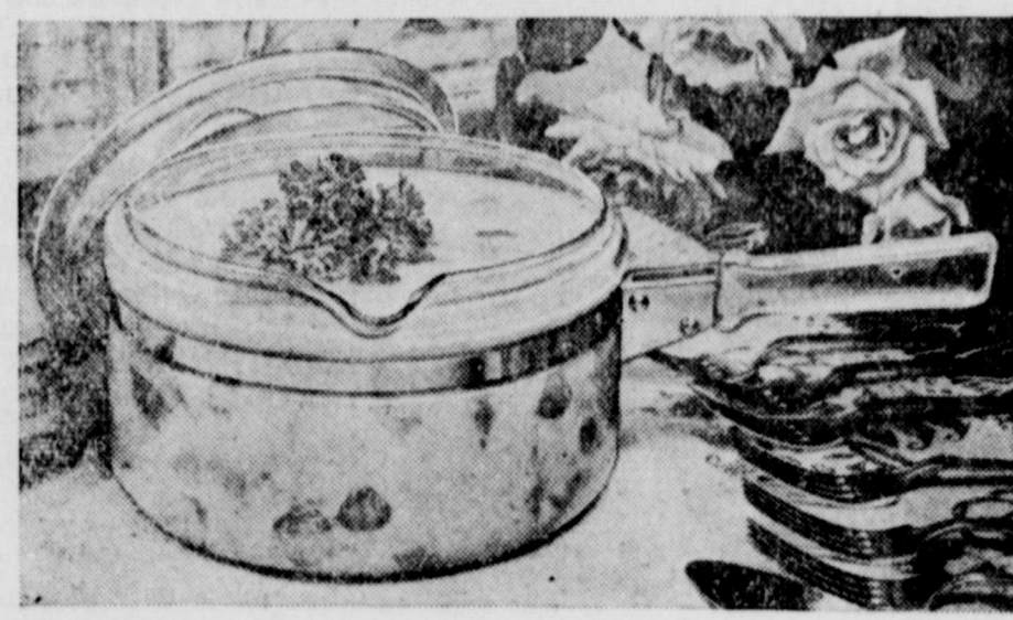
LEFT-OVERS CHALLENGE HOUSEWIFELY IMAGINATION (See Recipes Below)