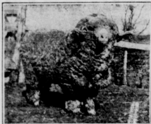
MY PRIZE WINNING STUD RAM