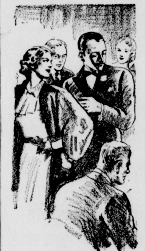
The Prince Was Most Self-Possessed.

"I was waiting to ask her about the handkerchief. She came out of the room, smoothing down her hair