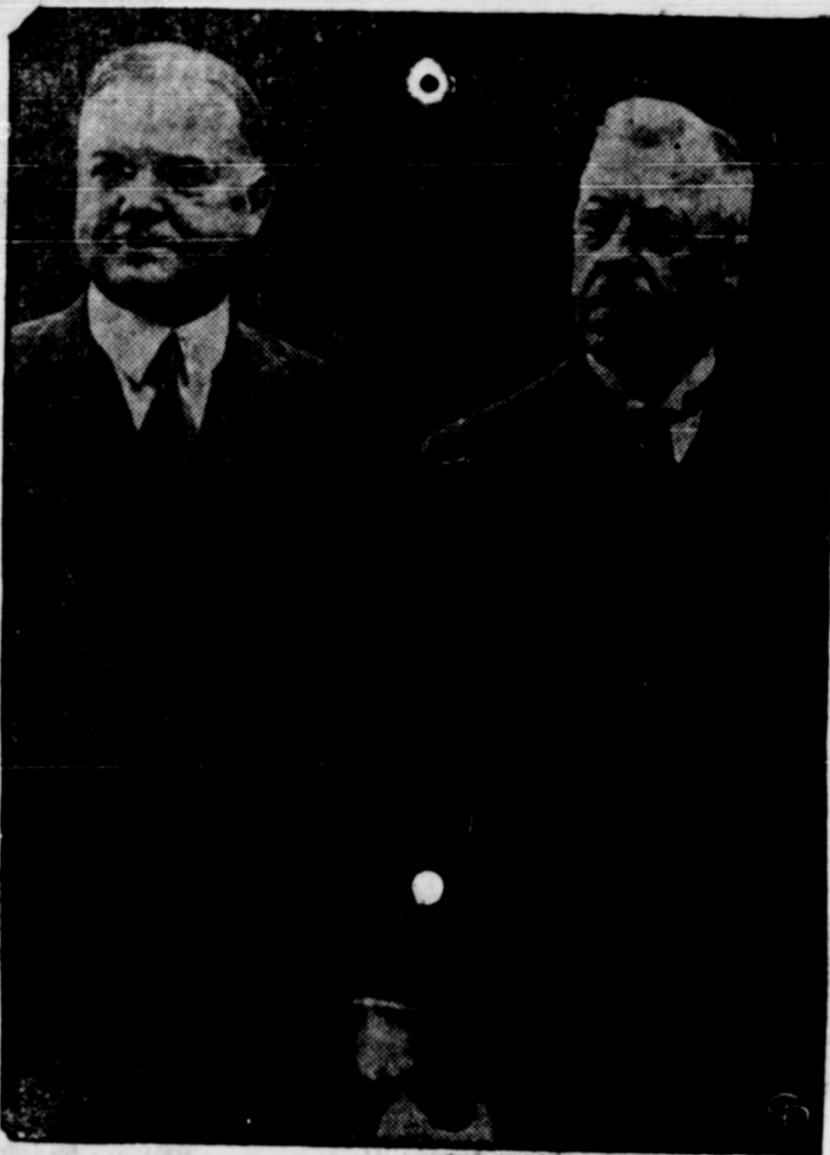
President Herbert Hoover and Dr. Hugo Eckener, commander of the Graf Zeppelin, snapped on the south lawn of the White House at Washington, where the 'round the world navigator received the praise of the nation's chief executive for his record-breaking voyage.