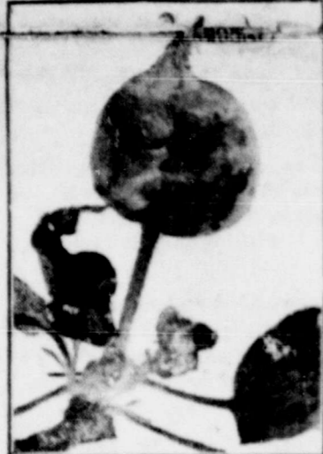
YOUNG APPLE INJURED BY ROSE CHAFER.

The "rose bug" usually disappears in from four to six weeks. In this short interval, however, it can do so much damage that its control is a problem of the greatest importance. In a