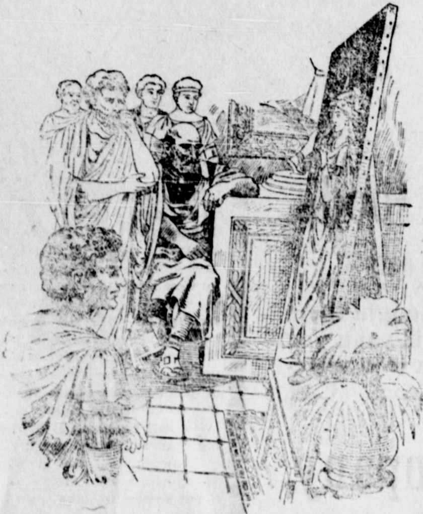
APPELES EXHIBITING A PAINTING.

Apples was exhibiting a beautiful painting a col- lected attention to a fault in the shoe and the maker immediately corrected it; the shoemaker then cried "The fault of the leg and Apples said, "Shoemaker, stick to your last." The advice of the painter stands as good in govern- ment as it does in art, but unfortunately many of our legislators have no last and others insist on legislating the most on things they know the least about. If our legislators would "stick to their last," we would soon have "fewer laws and better laws."