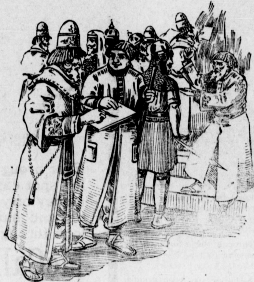
CONDEMNING ARISTIDES THE JUST.

The soul of state is in its people and a narrow, jealous and envious citizenship results in bigoted, revengeful and dangerous leaders and a weak and tottering government.