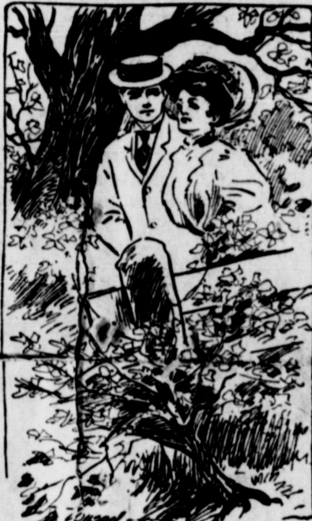
"The World Is Such a Beautiful Place."