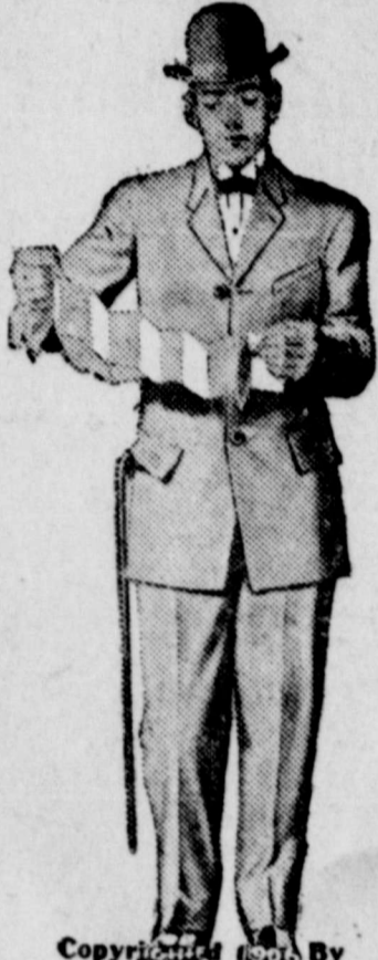
Copyright 1900 By SCHLOSS BROS. & CO. Fine Clothes Makers Baltimore and New York

Never in the history of this store have we ever collected together such a line of bargains in every department. We are now giving some of the greatest bargains ever heard of in the west. We are considerably over stocked is the cause. We went to market early with the cash and we were enabled to take advantage of a number of rare bargains. We bought more than we should have bought because the merchandise was so good and so cheap. We are giving it to you the same way we bought it.