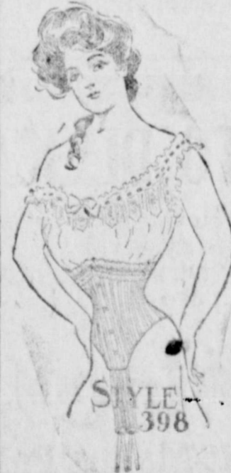
Corsets, all kinds, sizes 25c, worth $1.

This Sale is Now on and Lasts Thirty Days.