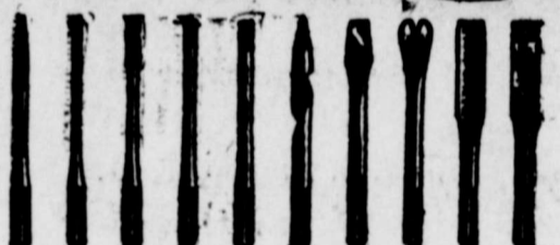
One Complete Pocket Kit of Ten Tools and handle, Well Made.