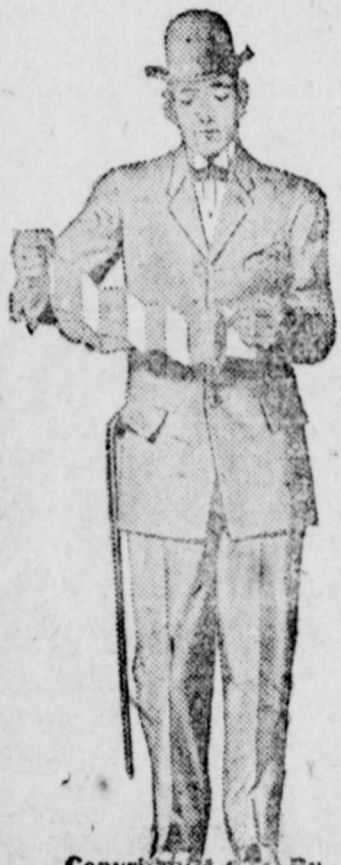
Copyrighted by SCHLOSSER BROS. & CO. Fine Clothes Makers Baltimore and New York

You may talk about your Clearance Sales and your Bankrupt Sales, but for the next thirty days we are going to sell 1000 Men's Suits, 1000 Youths' Suits and 1000 Boys' Suits of fine Clothing at any old price to get the money.