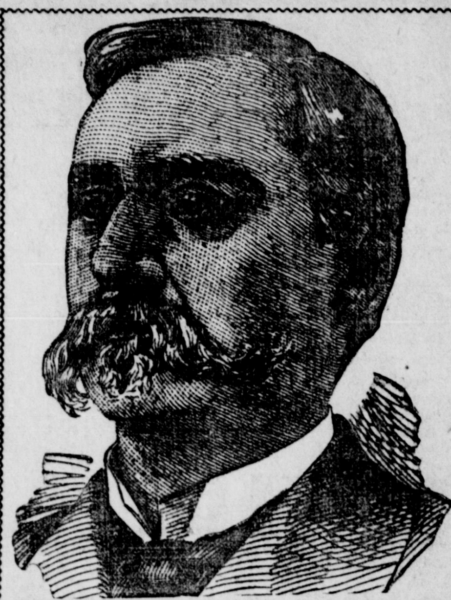
Hon. W. N. Koach, United States Senator from North Dakota.

SAYS THAT PE-RU-NA, THE GATARRH CURE, GIVES STRENGTH APPETITE.