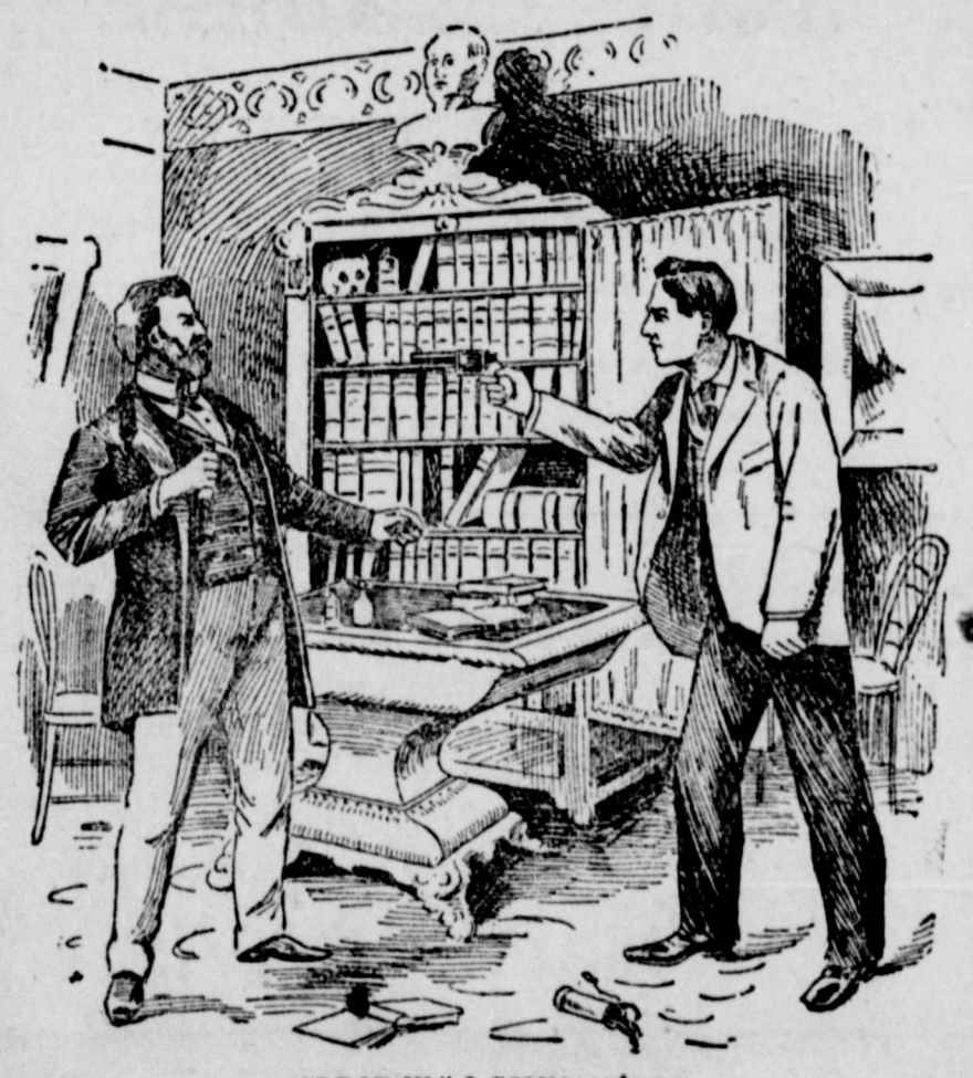
"DROP IT," I COMMANDED."

The sound money or administration Democrats continue to organise.