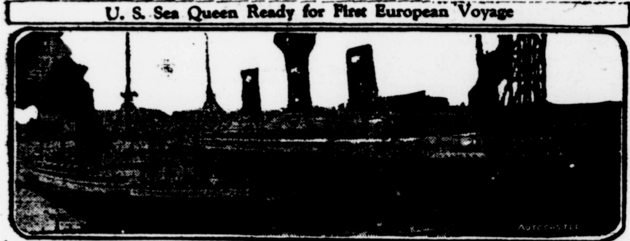
Home after establishing a new world record of 28.7 knots per hour on her trial trip to Bermuda Levisthon, "Queen of the Sens," is being prepared for her first transatlantic voyage as a passenger boat under the American flag. Thomsaids of New Yorkers lived the shore to welcome the hig boat into harbor Stream blowing for hours.