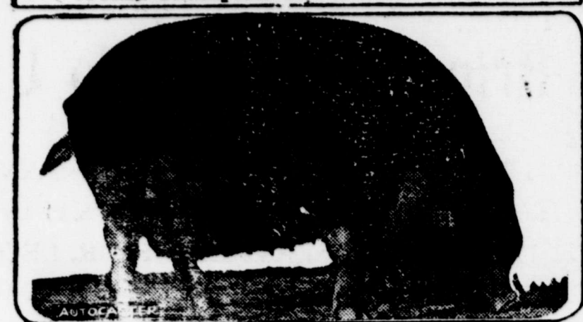
Liberator's Best 11, world champion sow of 1922, knocked into a cocked hat the theory that the show ring type is not a good farmer's hog when she farrowed twelve female pigs in April. She weighs 852