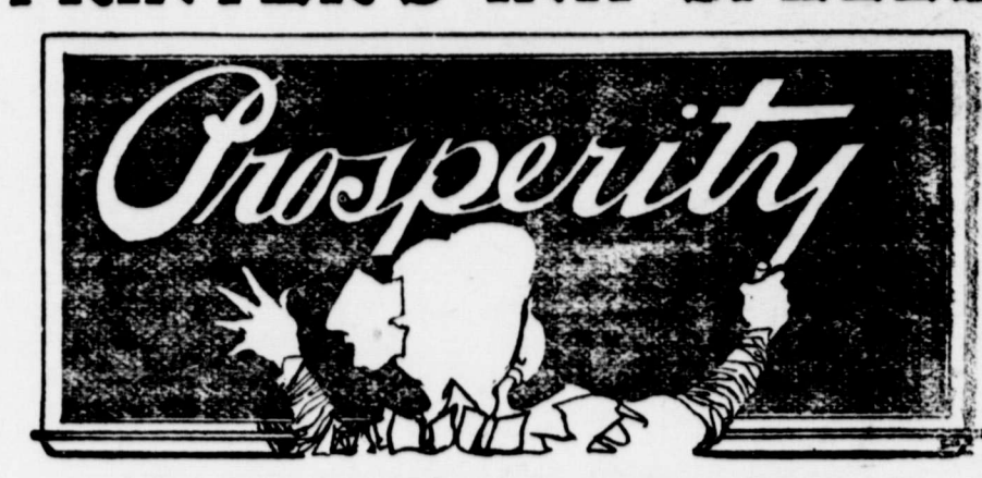
We Make It SPELL For YOU at Prices So Low They Will Astonish You

Come and Get Those Letter Heads You Have Been Needing So Long